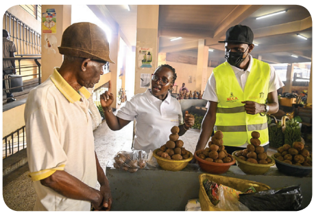
December 02nd, 2022: SHACU officials interacting with Wandegeya Market vendors during the clean our city activity which was symbolic to cleaning corruption out of Uganda.