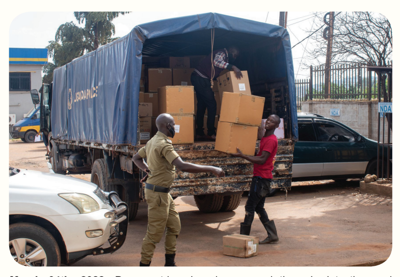
March 04th, 2022: Drugs retrieved and recovered through detection and disruption being delivered back to Joint Medical Stores offices.

Corruption is dynamic in nature, the Unit has adapted innovative ways to disrupt high profile corruption and grand schemes usually at the inception stage. Working with other agencies like ISO the unit has focused on the ability to tell the occurrence of acts or omissions of corruption. This has facilitated anonymous reporting by the citizens through a wide range of platforms, and liaison and information sharing with other government agencies.