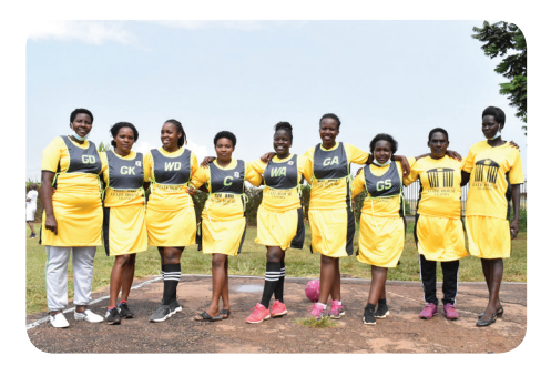
June 15th, 2022: State house Anti-corruption Unit Netball team pose for a team photo before participating on the Africa Public Service Day competitions.